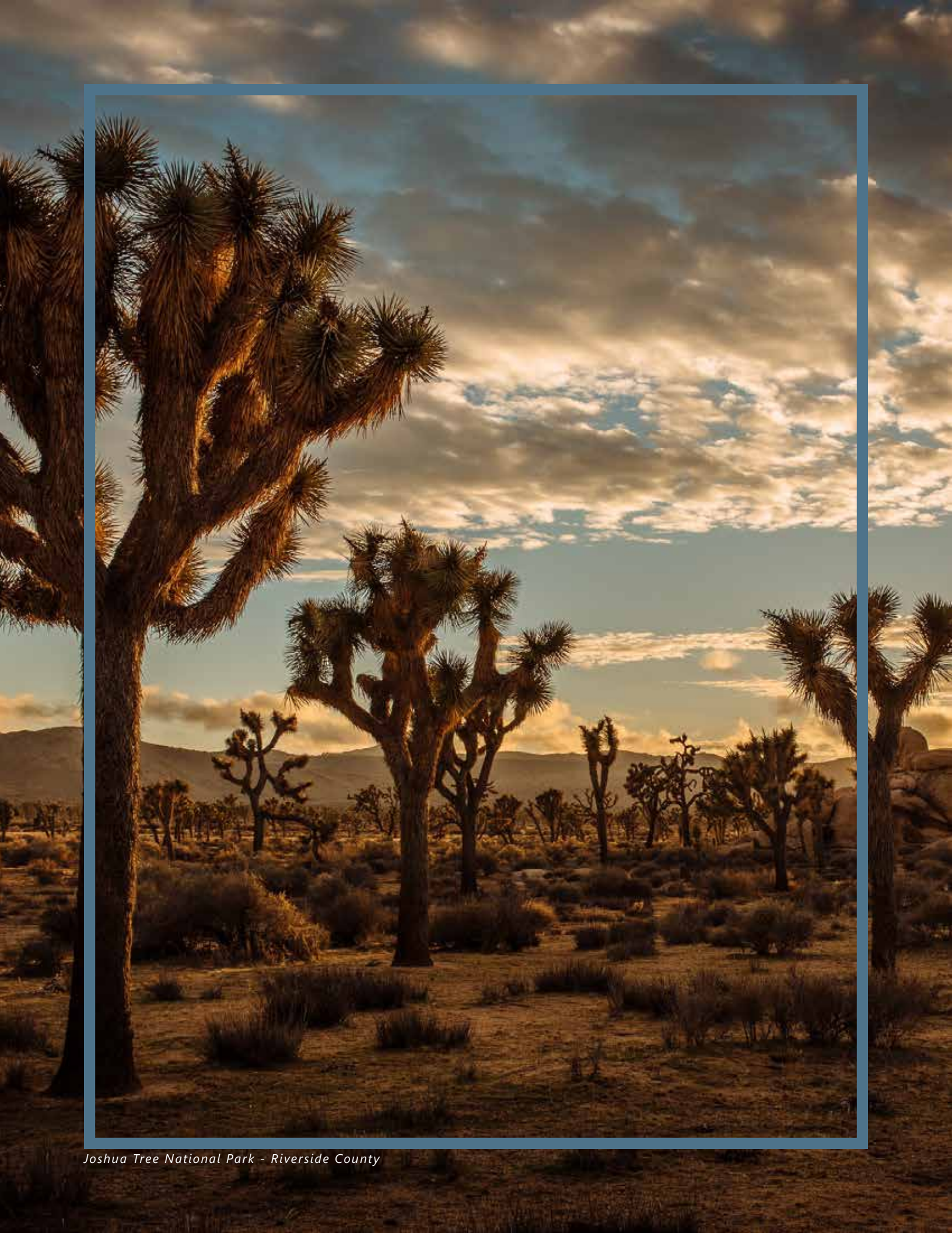
Joshua Tree National Park - Riverside County