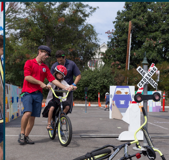
4 Students prepared for Walk to School Day with a miniature version of a city designed to teach safe walking and biking.