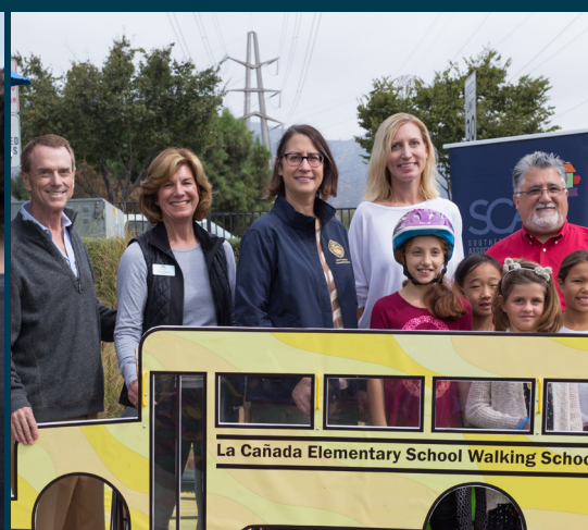
6 Elected Officials provided remarks to support the communities' effort to rethink their daily commute and to consider walking and biking.