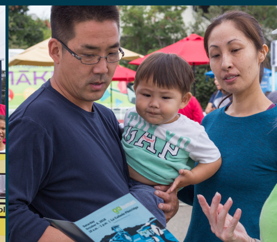
7 Participants shared support for demonstrated elements through engagement activities and surveys.