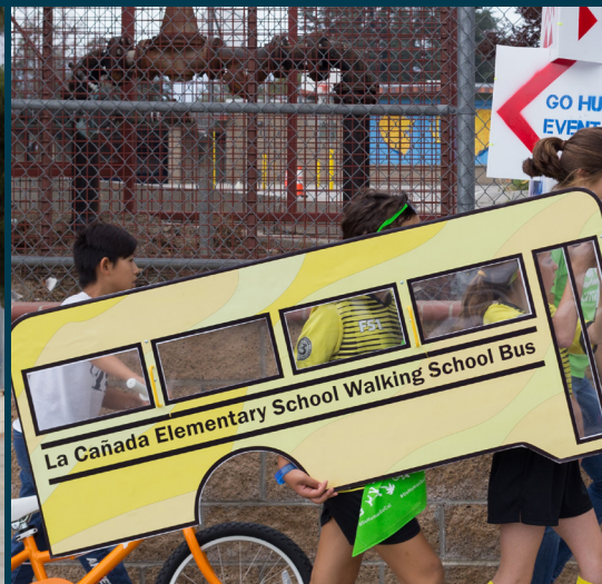
3 A walking school bus is a safe way for groups of children and parents to walk to school that encourages a healthy lifestyle, improves drop off congestion and reduces greenhouse gas emissions.