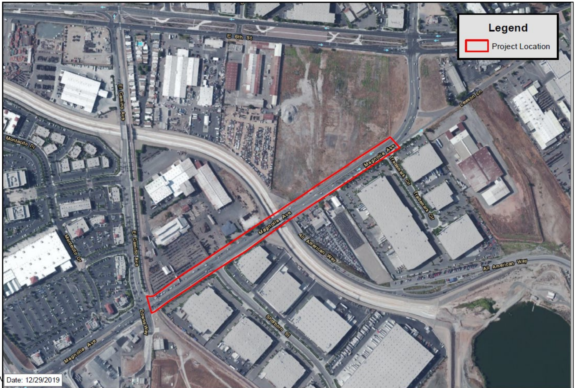
Figure 1 – Project Limits