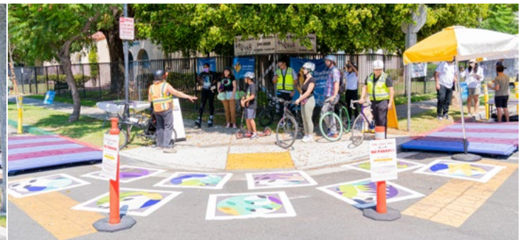
Curb Extension at 15th Street and Chestnut Avenue (left and right)