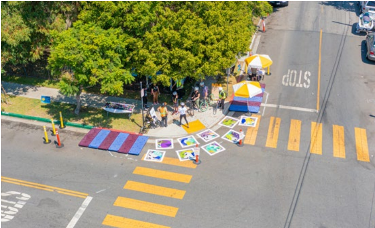
Curb Extension at 15th Street and Chestnut Avenue

The curb extension demonstration provided an on-the-ground example of the future community-driven curb extension murals that will be installed on every corner of the intersection of 15th Street and Chestnut Avenue.