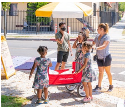
Evaluator interacts with participants

Arts Council for Long Beach had three main goals for their event: